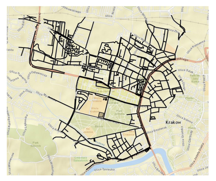
Fig. 1. Outline map of the dynamic lighting project in Kraków.

control decisions to each lamp in real time. An outline map of the project is presented in Figure 1.