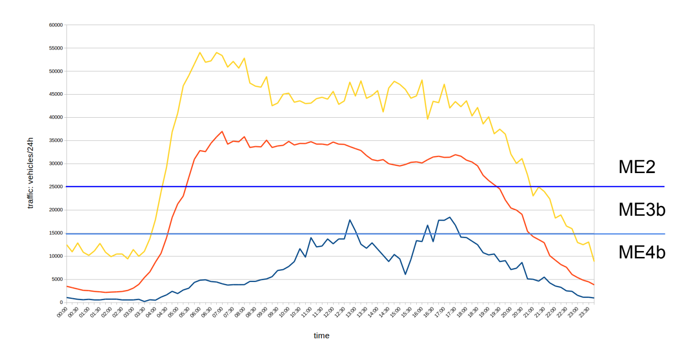
Fig. 4. Traffic intensity registered on different days in one of the streets within the Kraków project area. Horizontal lines denote the traffic level thresholds which allow switching from the main lighting class (ME2) to a lower one (ME3b or ME4b). Lighting classes as defined by the CEN/TR 13201-1:2004 standard [11].