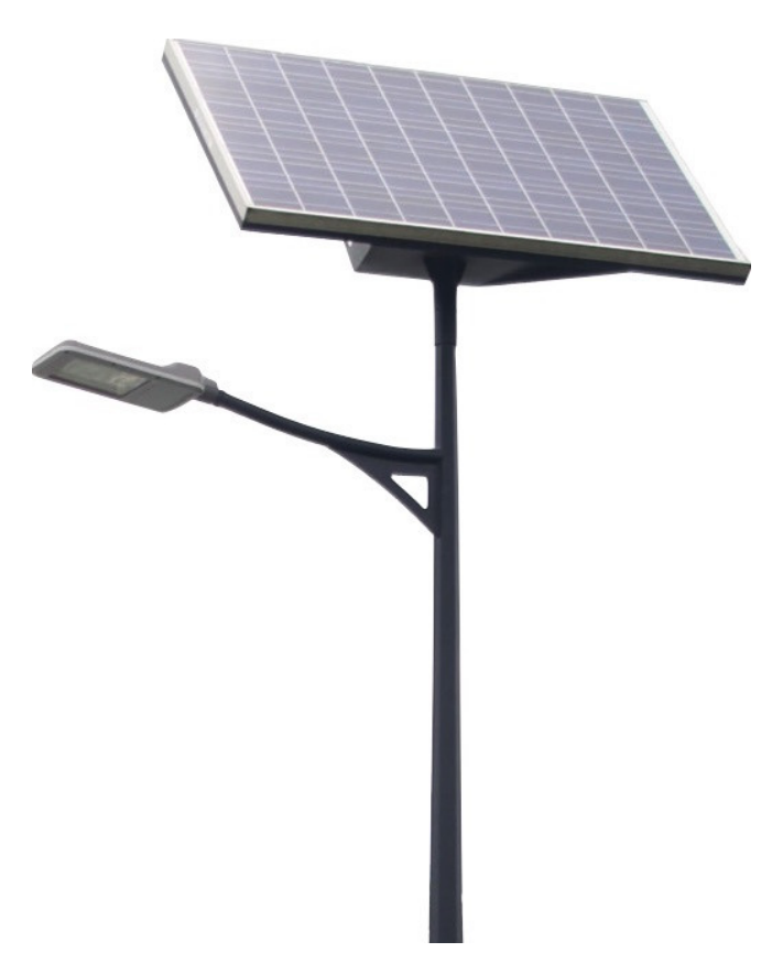
Fig. 2. An off-grid autonomous lamp, equipped with a solar panel and an underground battery.

approach. In fact, off-grid, renewable-based luminaires are being produced and used in many places around the World. An example of such luminaire is presented in Figure 2. Such devices are ideal for locations with no power infrastructure or as temporary lighting for events, etc. However, their largescale utilisation for urban street lighting has two problems: