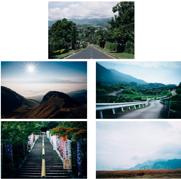
Fig. 1. Photographs for the stimuli