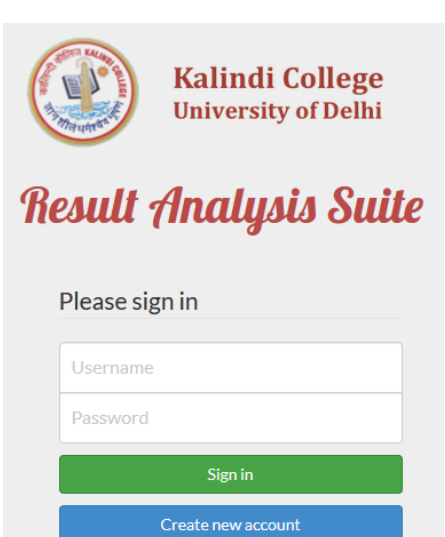
Figure 1: The Login Screen of the Front end UI

In the proposed system the whole result data can be collected in a database using the Web Automation technology, in which it will access the details of students from the data available on website under the student details section and automatically filling up the forms as well as downloading them for further use. This is done in less than two minutes by automation.