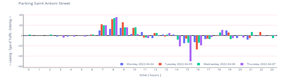
Figure 5. Visualization of the Type of traffic

Figure 5 is presented a visualization of the Type traffic in a 24hour period from 0 a.m to 23 p.m. The X-axis represents one-hour time periods. Every period shows an aggregated value of Type traffic. There are data comes from four days from the 4th of April to the 7th of April.