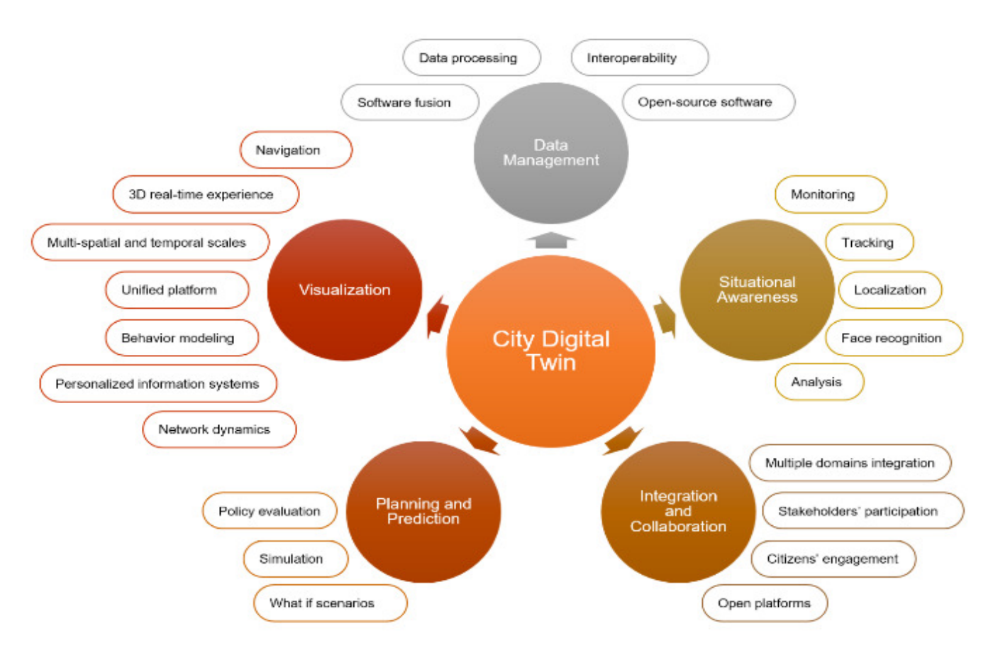
Figure 2. City Digital Twin potential. Source: [11]

contributions from the different stakeholders and their accessibility to the city data [11].