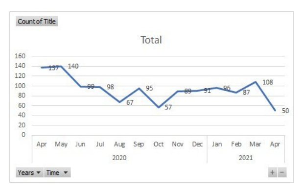
Fig. 2 The articles related to Covid-19 that was published on the UK government portal

The decrease in the number of published information related to Covid-19 on both websites showed that although two countries had two different approaches to Covid-19 in the early stage, the amount of information all decreased although there have been many waves of Covid-19 in both countries in that period of time. Both of the two countries showed the decrease of interest in the information of this sickness over the time. It could be explained as at the beginning of this pandemic, most nations did not know much about this virus so the government needed to provide lots of information about this virus. This finding is similar to the