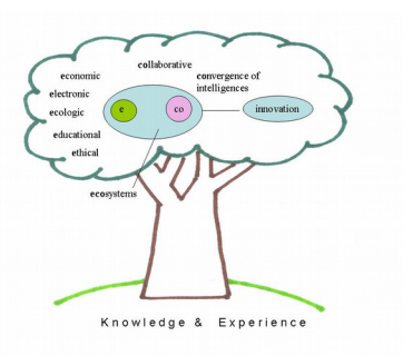
Fig. 1. e-co-innovation principles [9]

Another approach, connecting the best from technology and the best human capacity is those of e-co-innovation, considering all components, see Figure 1.