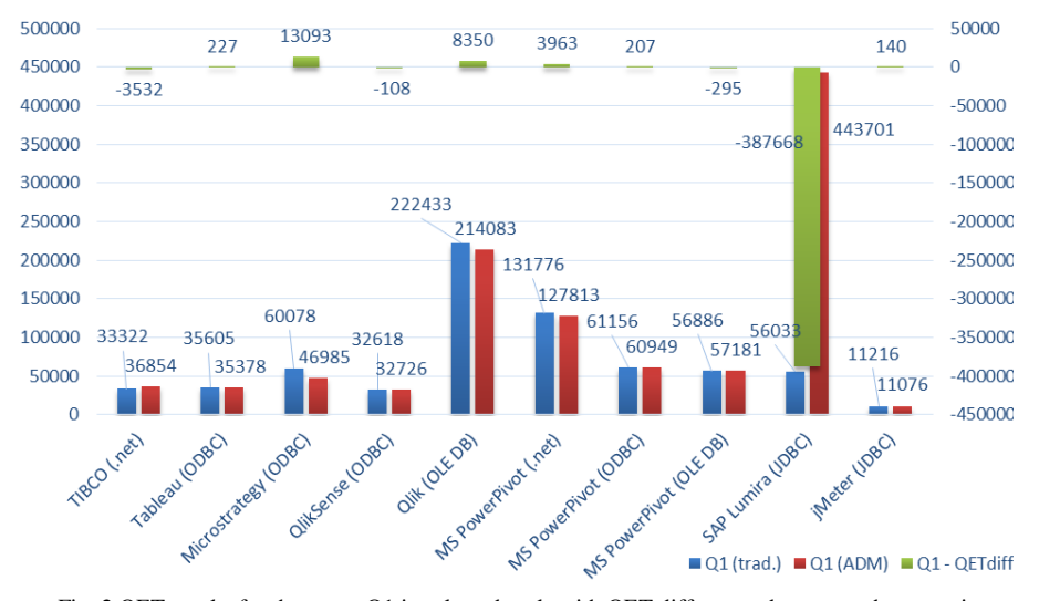
Fig. 2 QET results for the query Q1 in selected tools with QET differences between schema variants