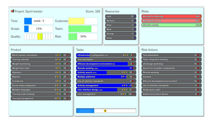
Fig.\ 1\ The\ GraPM\ game\ user\ interface\ mid-game

The GraPM game was implemented within an engineering diploma project in 2014 [19]. It is a JavaScript-based rich internet application run in a web browser, see Fig. 1.