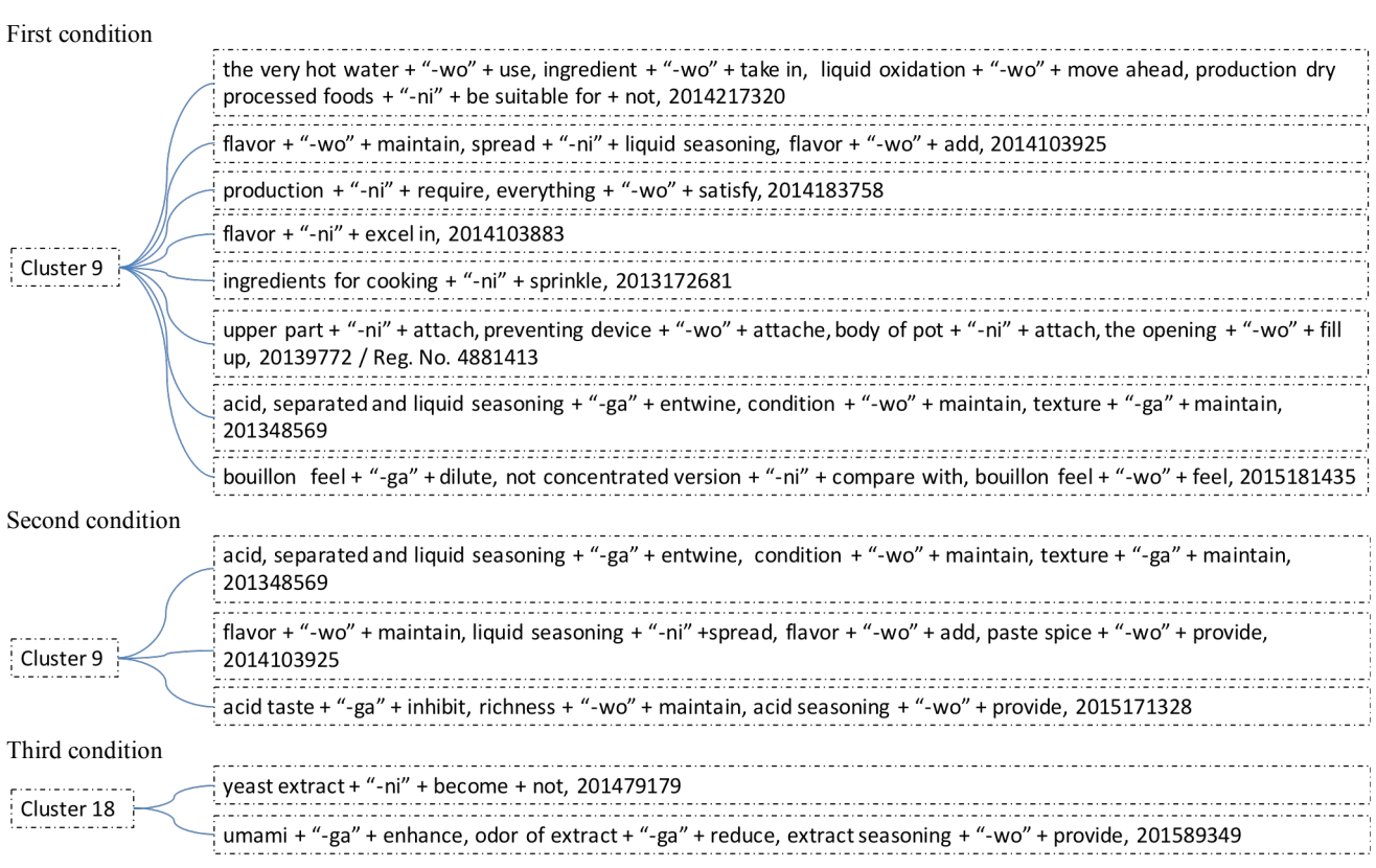
Fig. 2 Part of clusterization of patent documents in three conditions

First condition used the distance determined by the case vector, second condition used the distance by the sentence vector with the verbs as feature amount and third condition used the distance by the sentence vector with the nouns as feature amount.