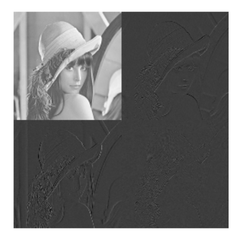
Figure 3. Lena image authentication in the presence of forgery attack (with extra hair on the forehead)

The authentication for a forged Lena image is shown in Fig. 3 (note the extra hair on the forehead). The LL band of the forged image has a Hamming distance of 17235 to the LL band of the original Lena image of similar dimension. This results in a failed authentication for the forged image.