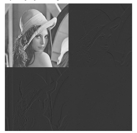
Figure 2. Lena image authentication in the presence of COFDM with rate 1/2 LDPC codes

Results obtained in the presence of COFDM transmission are shown in Fig. 2. COFDM transmission is considered in the presence of regular LDPC codes of rate 1/2 as the forward error correction codes. As all, or most, of the errors are corrected by the LDPC decoder, the image is declared authentic by the proposed algorithm.