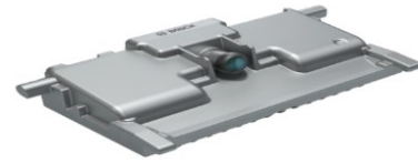
Fig 2. Sample multi-purpose camera used for High Beam assistance

The intelligent headlight control is composed by an onboard camera for data acquisition and special image processing algorithms for measuring the ambient brightness and estimating the distance from vehicles placed in front and the oncoming traffic [9][10][11].