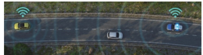
Fig 1. Wi-Fi solution in car-2-car communication

The technology used in this implementation is based on an automotive optimized variant of WLAN technology known as "ETSI ITS-G5". A car who is equipped with this technology will always be informed on such situations in advance, and it is not needed to rely anymore on GSM internet network [2].