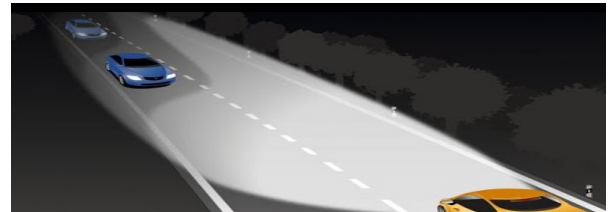
Fig 3. Light tunnel created to protect detected vehicles

The headlamps of the car are controlled by an electronic unit, based on the decisions taken after the captured images are processed. The road users who are in the beam range will be automatically excluded from the light distribution of the beam and put in a dark zone.